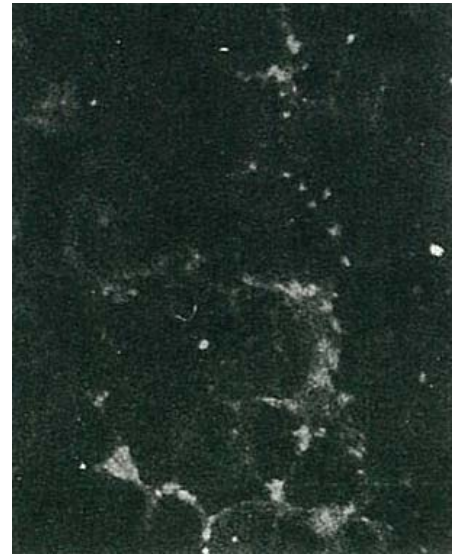
Fig.2 Detection of HCV NS5b protein by immunofluorescence antibody staining. Chimp liver cells were infected with recombinant vaccinia virus containing a HCV genome cDNA. After incubation for 48 hr, the cells were fixed with acetone and HCV NS5b protein was detected by indirect immunofluorescence staining using this antibody.