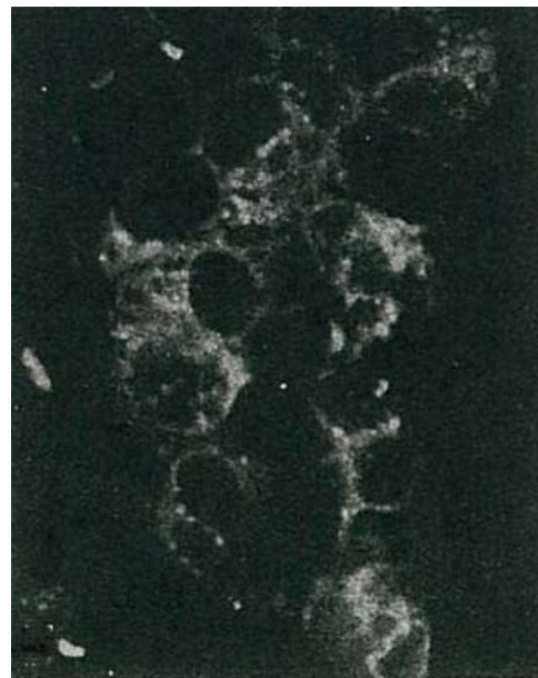
Fig.2 Detection of HCV NS5a protein by immunofluorescence antibody staining. Chimpanzee liver cells were infected with recombinant vaccinia virus containing a HCV genome cDNA. After incubation for 48 hr, the cells were fixed with acetone and HCV NS5a protein was detected by indirect immunofluorescence staining using this antibody.