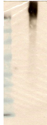
Figure 1. Western blot analysis of parylated PARP (cat# 4500-10-P). 15 µl of a 1:10 dilution of PARP-PAR in sample buffer were separated on a 4-20% Tris-Glycine SDS-PAGE gel and blotted on to PVDF membrane.

Ribosylated proteins were detected with 1:1000 dilution of anti-PAR followed by a 1:5000 dilution of HRP conjugated goat anti-mouse IgG and visualized using chemiluminescence.